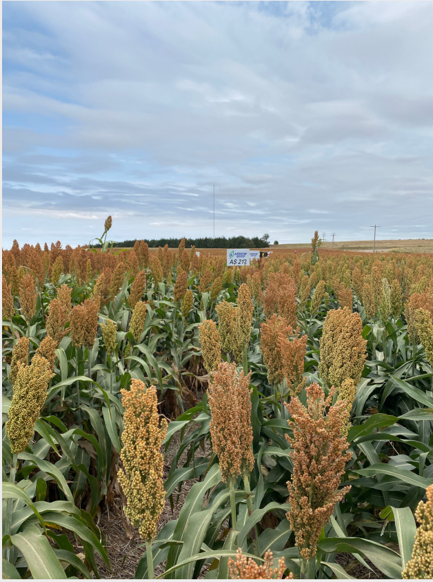
A view of Mike Baker's plot near Trenton, NE