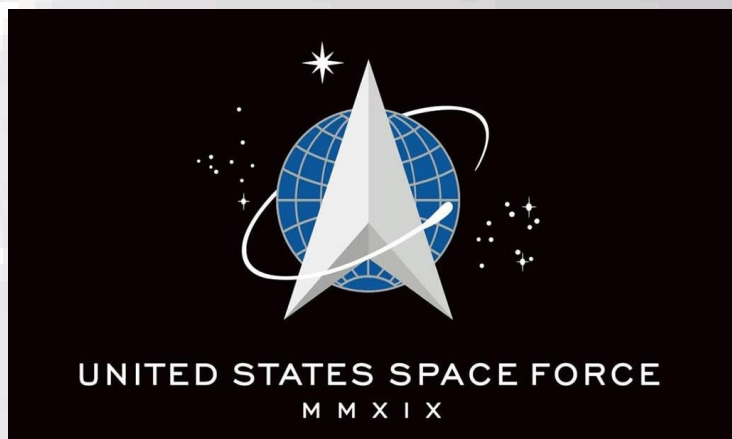
The USSSF Flag

See media coverage of the event by clicking the button here: