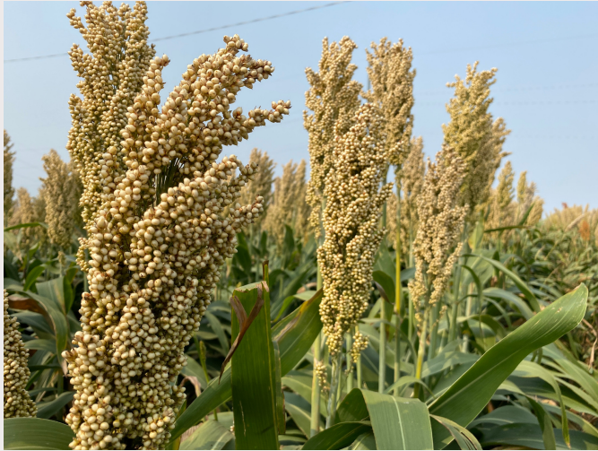
Sorghum is in high demand