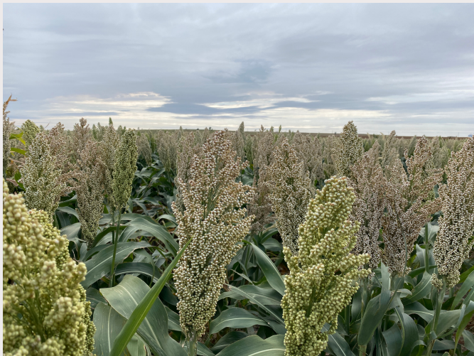
Food-Grade sorghum commands a premium in specialty markets

2020 is a good year in which to be a sorghum farmer in Nebraska! Increased purchases by China have resulted in higher cash bids and increased demand for our crop. While Nebraska farmers don't realize the full premiums in the market due to lack of proximity to shipping in the Gulf of Mexico, sorghum bids in Nebraska have been as much as 90 over cv in parts of nonetheless. In the Texas, Sorghum was at 200 over cv on October 2nd, with contracts a full year out. Given the importance of sorghum to China, both as a non-gmo crop as well as the key ingredient in baijiu, we anticipate that this trend will continue in the near future. In fact, China's purchases in 2020 alone account for nearly 80% of the entire sorghum crop in the United States.